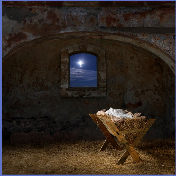
Arrival in Bethlehem