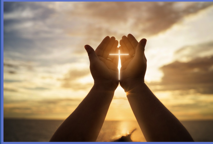
Arrival in your life