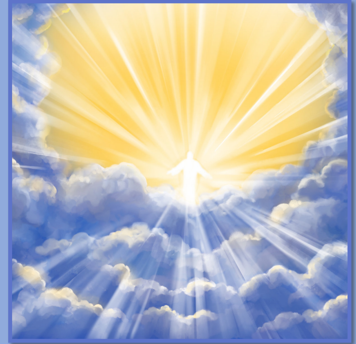
Arrival to come