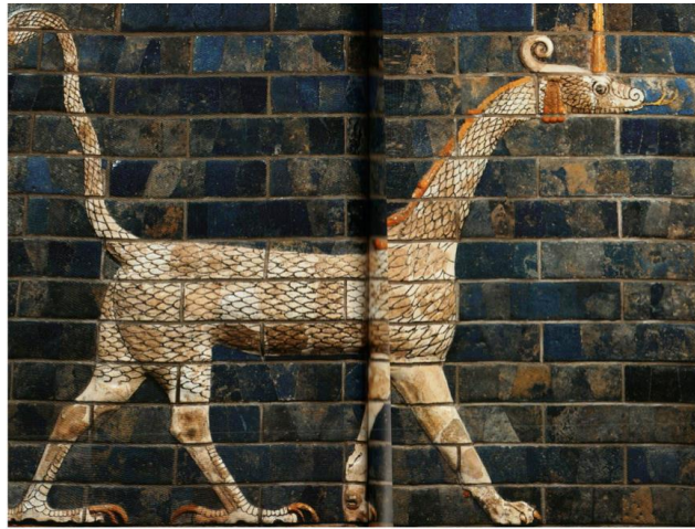
The "dragon" that represented the supreme god Marduk was a composite of eagle (rear legs), lion (front legs) and serpent (head and tail).

The major emblem in Nebuchadnezzar's capital was that of the Mushhushshu , typically translated as "dragon." This was the symbol of the king of the gods, Marduk. This creature combined the elements of a lion, an eagle, and a serpent. There were many ceramic glazed representations of this composite creature throughout the Ishtar Gate. Marduk was so powerful; over time he seemed to embody the traits and functions of the other lesser gods. 5