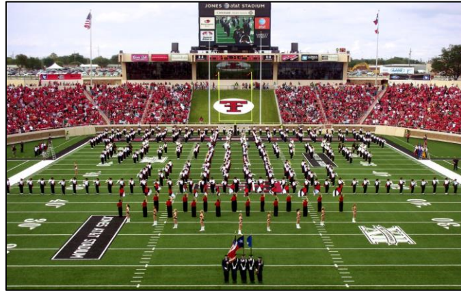
Yards of distance