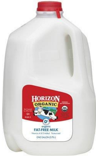
Gallon of milk