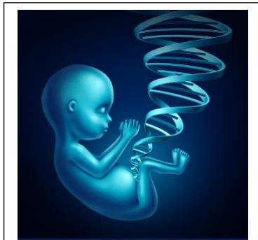
Egeneto – made, came into being, was born

This section of John’s prologue introducing John the Baptist starts with an interesting Greek phrase, Egeneto anthrōpos (Ἐγένετο ἄνθρωπος). Look carefully at each word, because they give clues to their meanings in the English words that have derived from each.