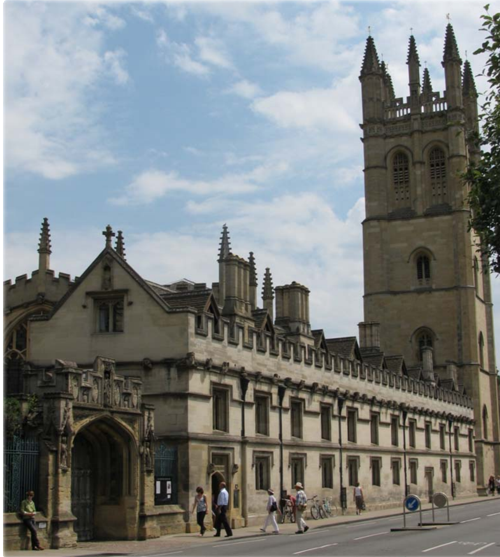
Magdalen College Oxford University