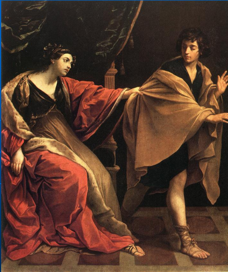
GUIDO RENI 1631