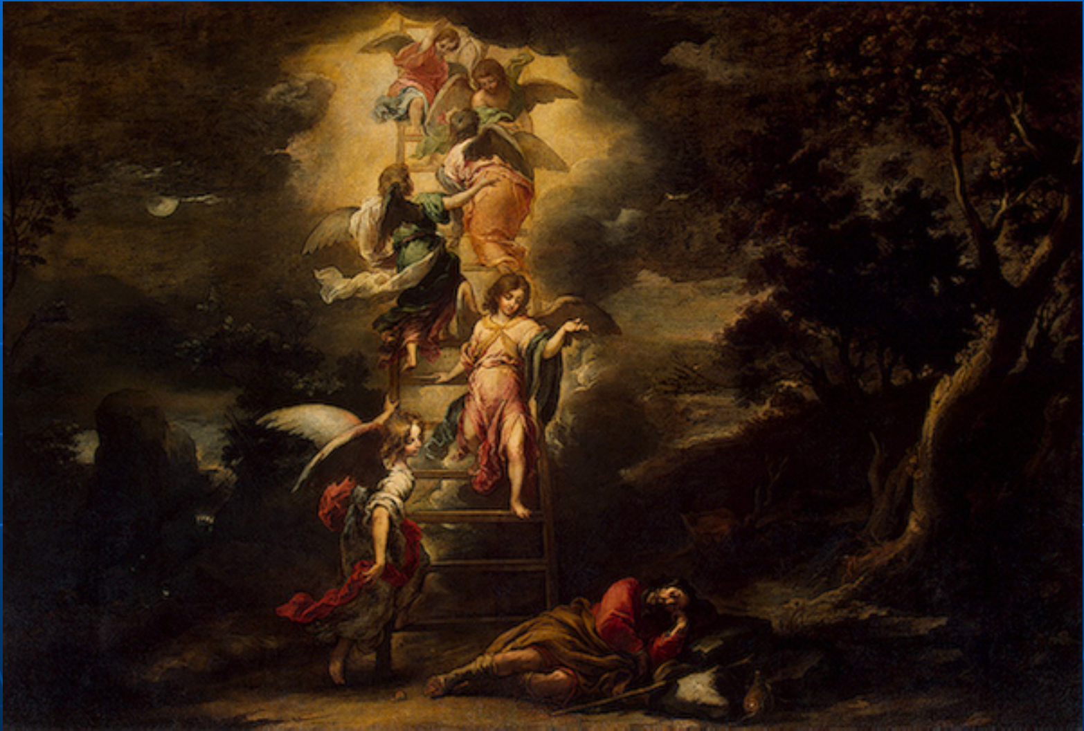
BARTOLOME MURILLO 1660s