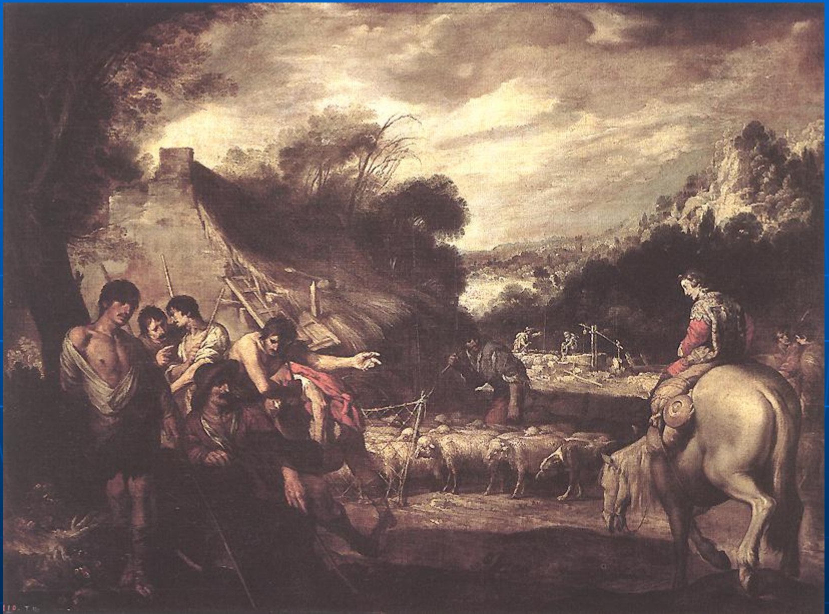
ANTONIO DEL CASTILLO - Mid-1600s