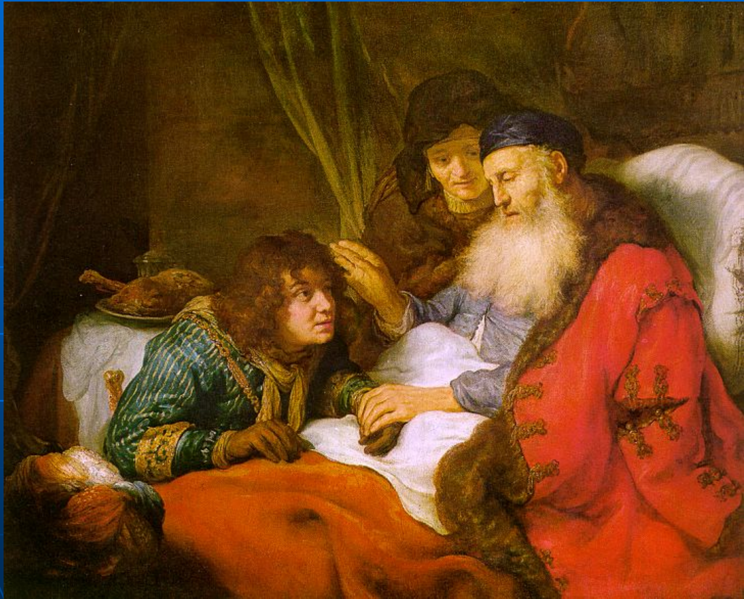
GOVAERT FLINCK 1639