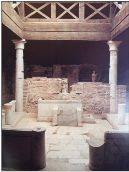
A peristyle of a terrace house in Ephesus.