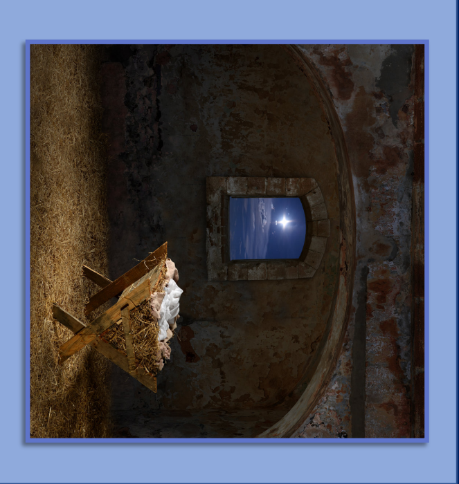
TRUST/FAITH in God