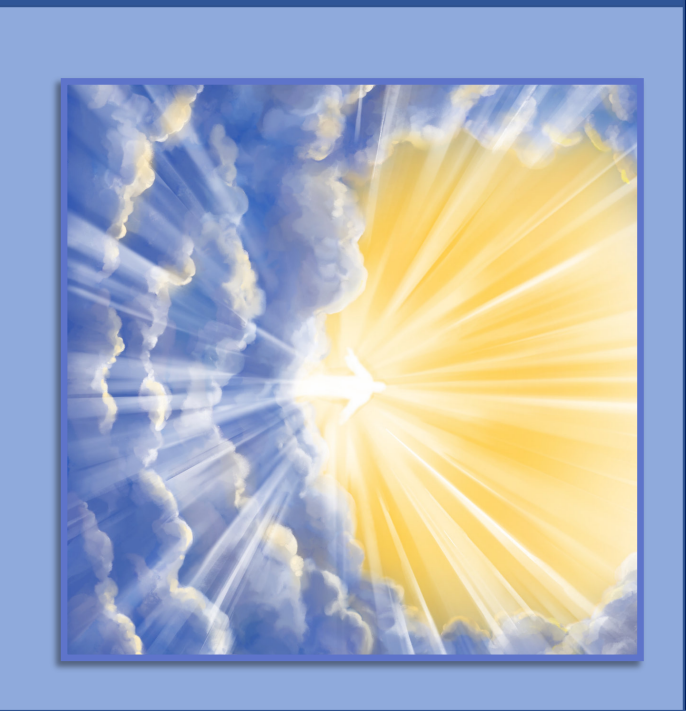
Arrival to come