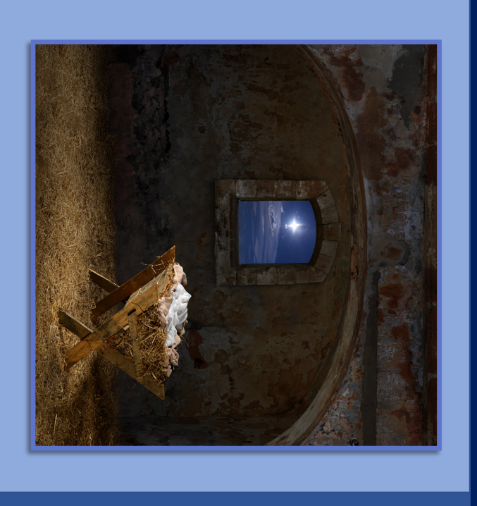
Arrival in Bethlehem