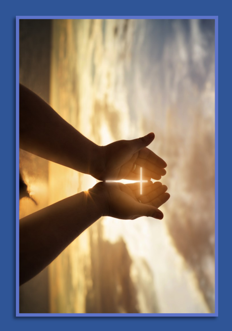
Arrival in your life