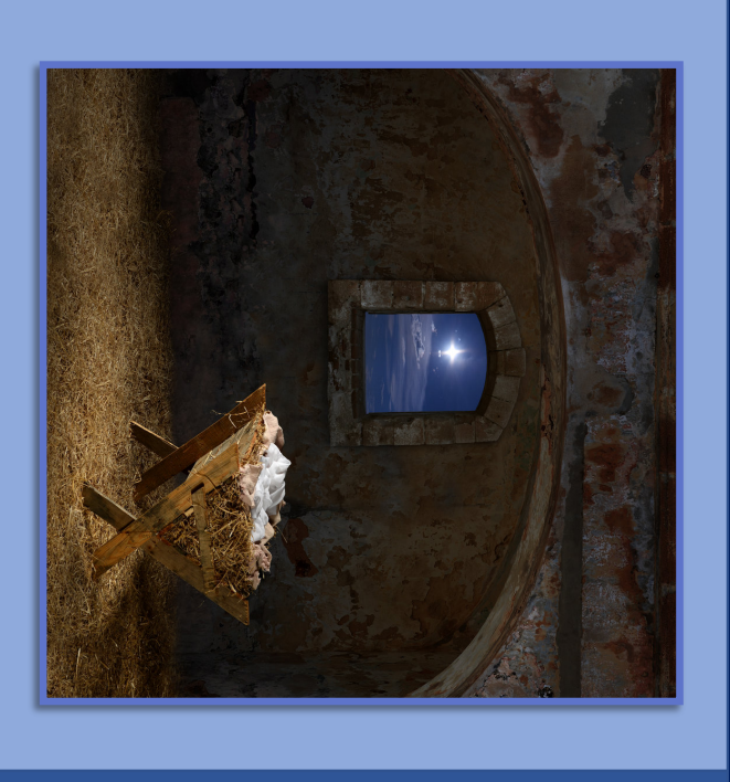
TRUST/FAITH in God